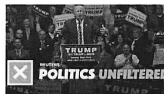
Huge win in NY could right Trump's ship